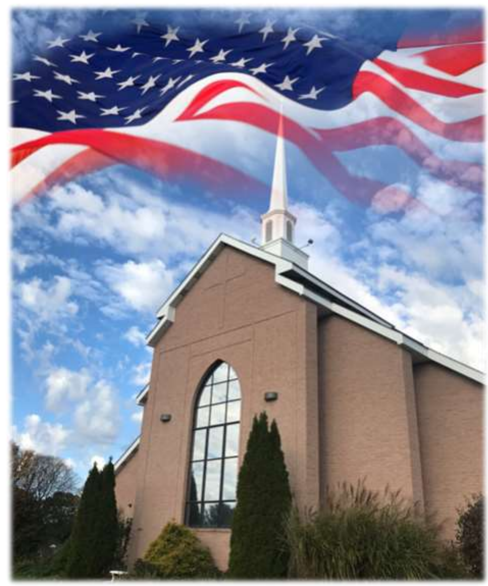
August 27, 2023